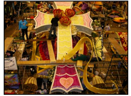
Miracle of Faith-2006