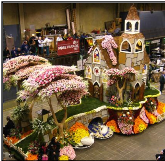
God's Great Nature-2007