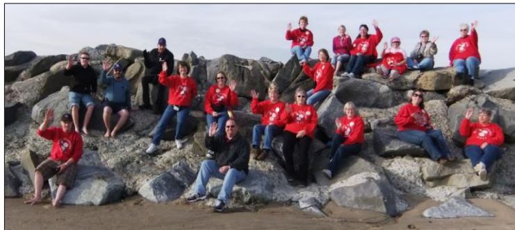
2011 Petal Pusher Team