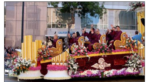
Alleluia Chorus - 2009