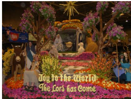
Passport to Celebrations-2008