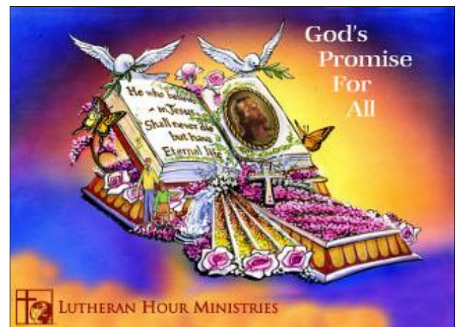
Artist's Sketch of Lutheran Hour Float - 2012