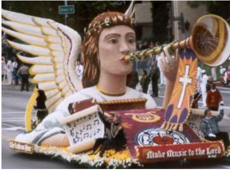
Make Music unto the Lord-2004