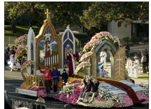
Lutheran Hour Float-2011