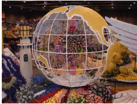
Family of God-2005