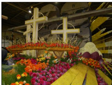
10 Commandments -2010